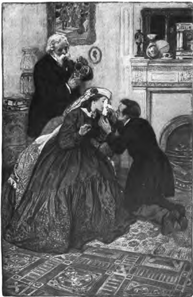
THE CAPTAIN AND CYRUS WERE AFRAID OF GUSSIE